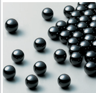
Si 3 N 4 氮化矽 球圖