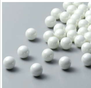
ZrO 2 氧化鋯 球圖