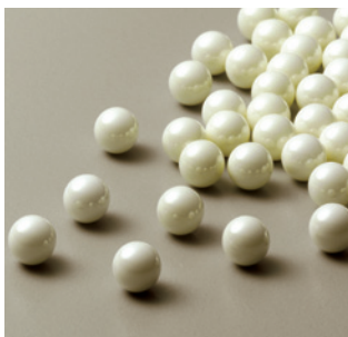
Al 2 O 3 氧化鋁 球圖